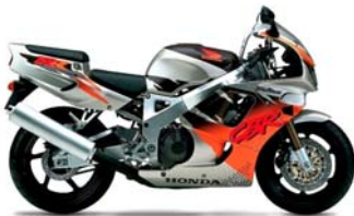
Example of a pure 'on road' design bike

If your bike falls into the category where it has some on road features but is predominately an off-road bike, the Administrator may grant Import Approval if you agree to the following: