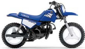
Example of an 'off road' bike

Generally if a bike was designed principally for 'on road use' and has lights, blinkers, side mirrors and provision for a number plate, it is regarded as an ON ROAD bike. However there are cases where some bikes are manufactured with the above features but are still regarded as an off road design. Below are examples of off/on road bikes: