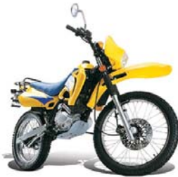
Example of a bike that has 'on road' features but could be also classed as 'off road' bike.